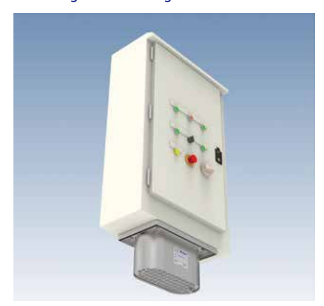
Underneath mount PV5