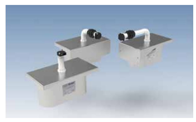
Underneath mount PV5, Wide mount PV5, Narrow mount PV5

Protecting and ventilating vital electronics inside control and IT data cabinets/panels